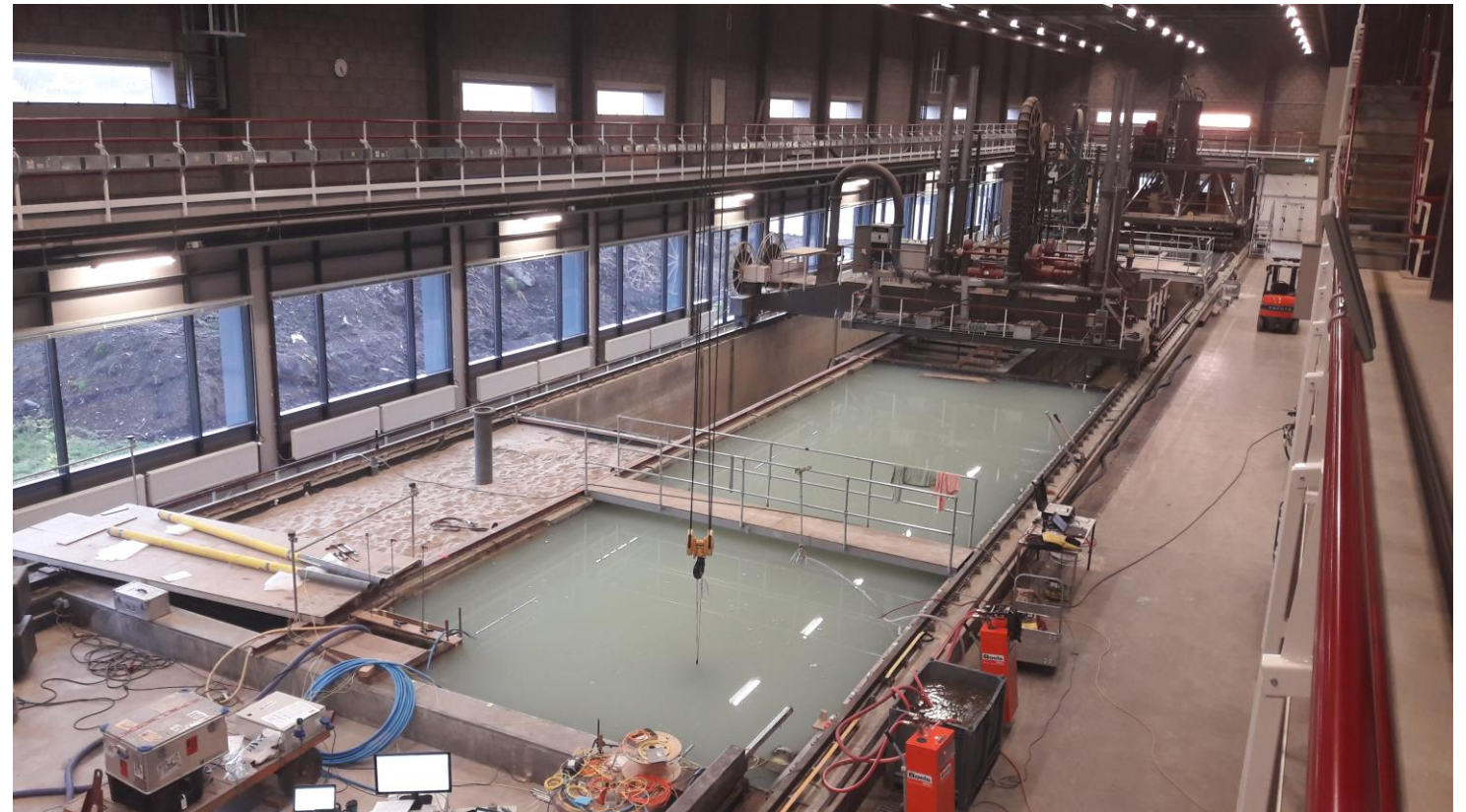
Testing facility: Water-Soil Flume - Deltares